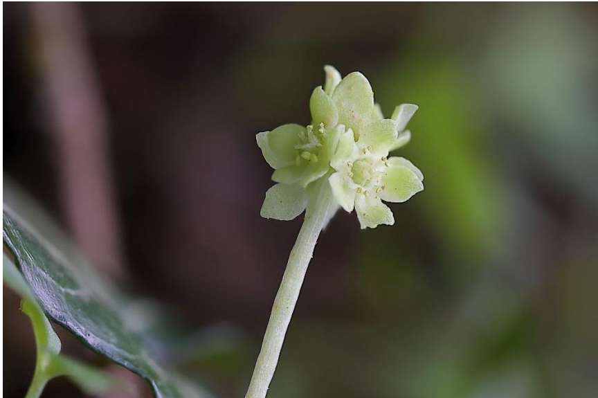
Moschatel flower head