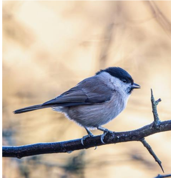
Marsh Tit – Weir Wood Dec 25