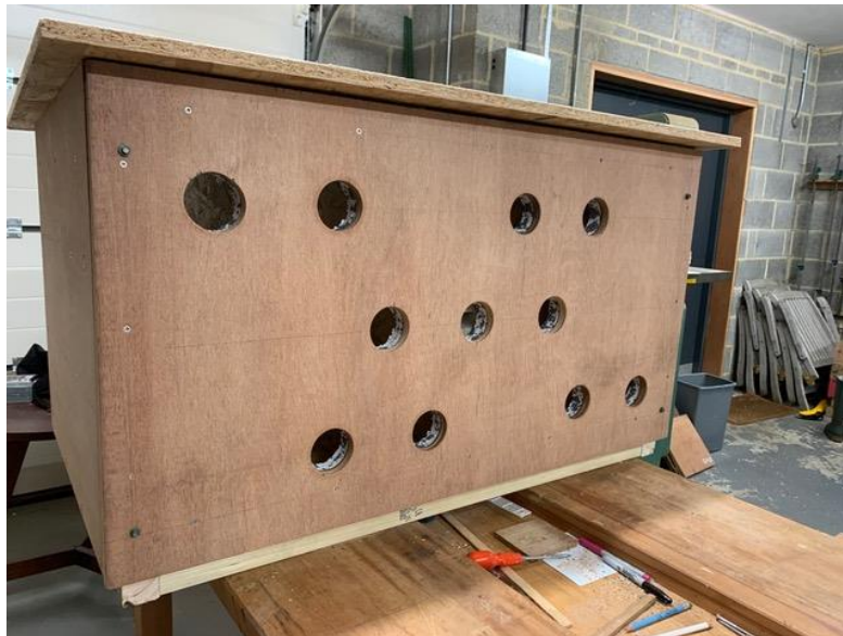
Our Sand Martin “bank” under construction