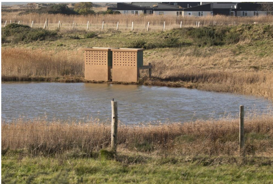
Artificial Sand Martin Bank at RSPB Medmerry

RSPB Medmerry has recently installed something similar. Again there are no records of Sand Martins breeding there, but like us they are hoping that by providing the artificial banks, the birds will come.