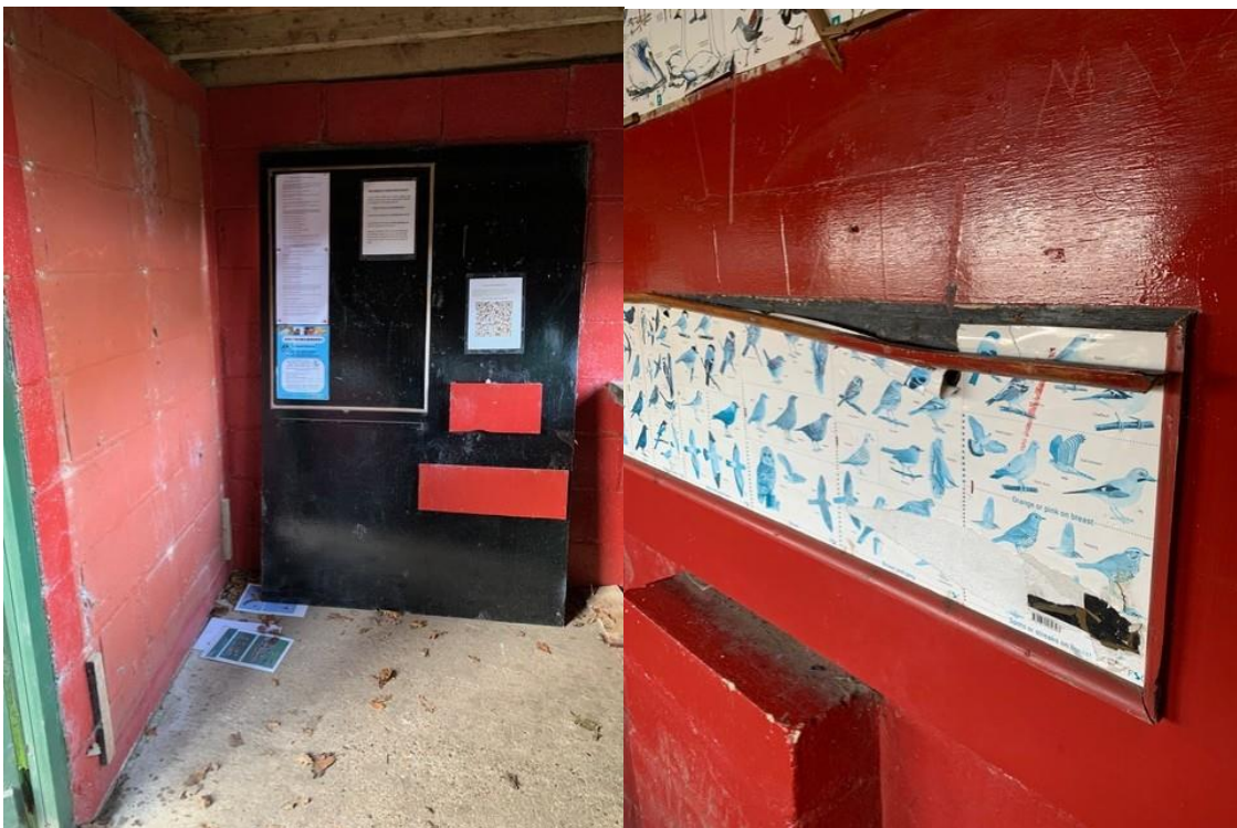
Damage inside the hide – Dec 25

Whilst we frequently encounter evidence of low scale anti-social behaviour having taken place in the hide, this is the first time for a while that we have experienced serious damage. The hide's remote location means that sadly it will always attract ne'er-do-wells, but we remain determined to keep the hide open for the enjoyment of the majority who just want to come along and enjoy watching the birdlife.